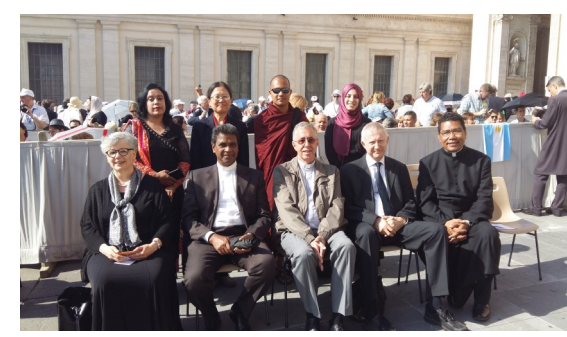
A Nostra Aetate Foundation group at a papal General Audience in 2016.

"One is the community of all peoples, one their origin, for God made the whole human race to live over the face of the earth. One also is their final goal, God." Nostra Aeate 1